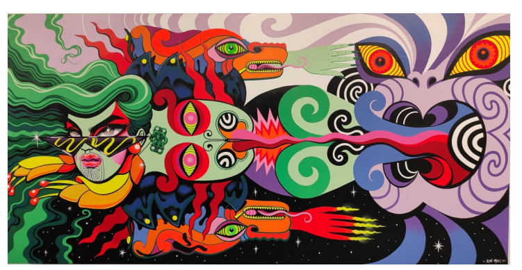
The artwork of Xoë Hall seen at Te Waka Huia o Ngā Taonga Tuku Iho (Wellington Museum)